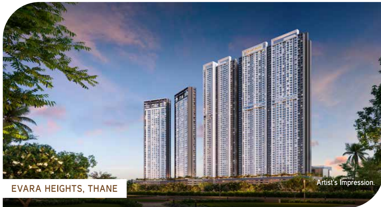
EVARA HEIGHTS, THANE