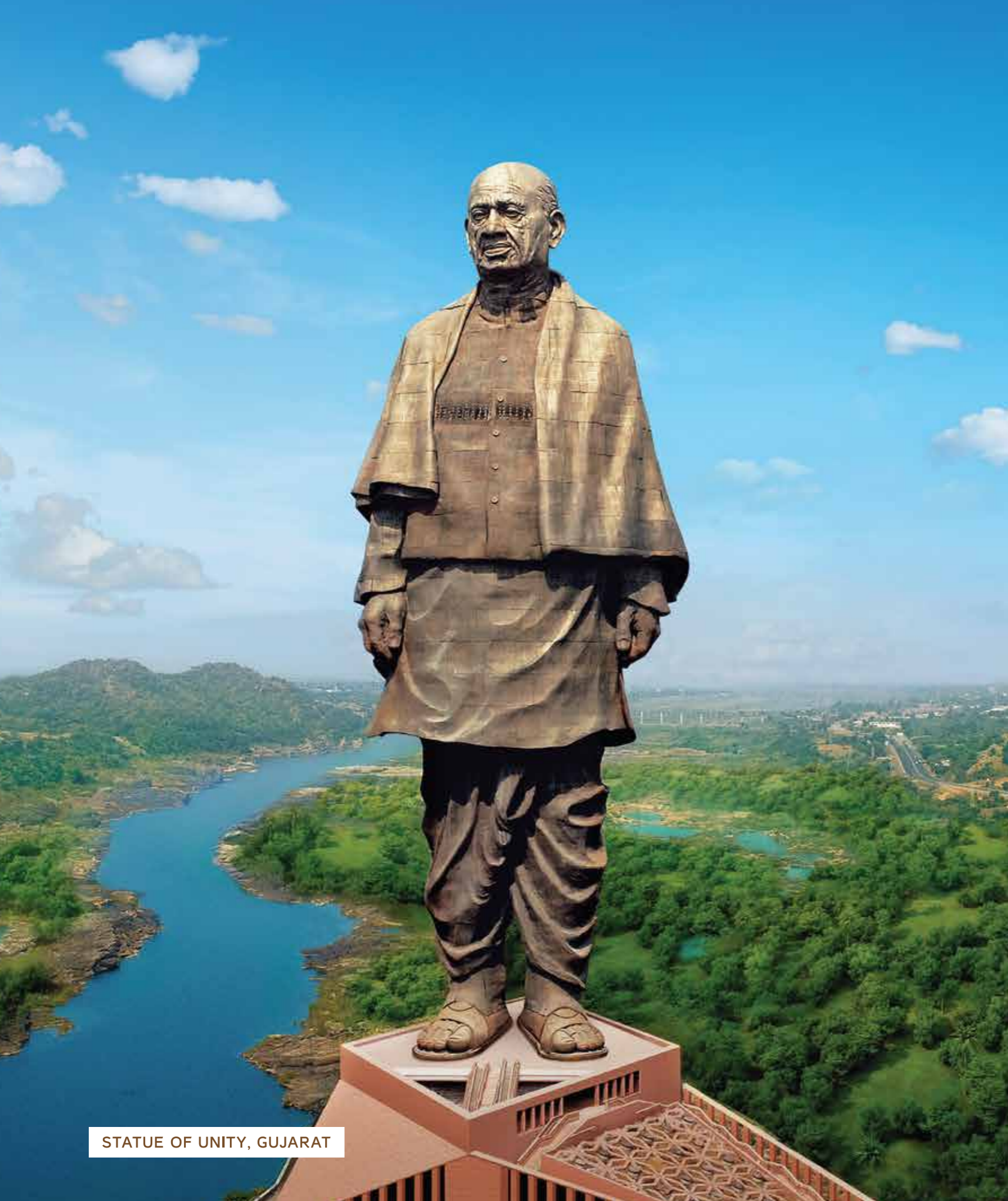
STATUE OF UNITY, GUJARAT