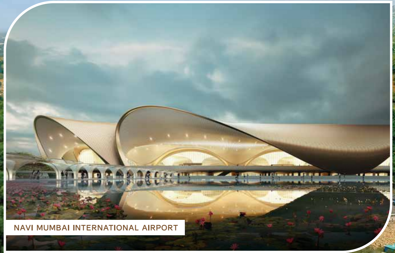
NAVI MUMBAI INTERNATIONAL AIRPORT