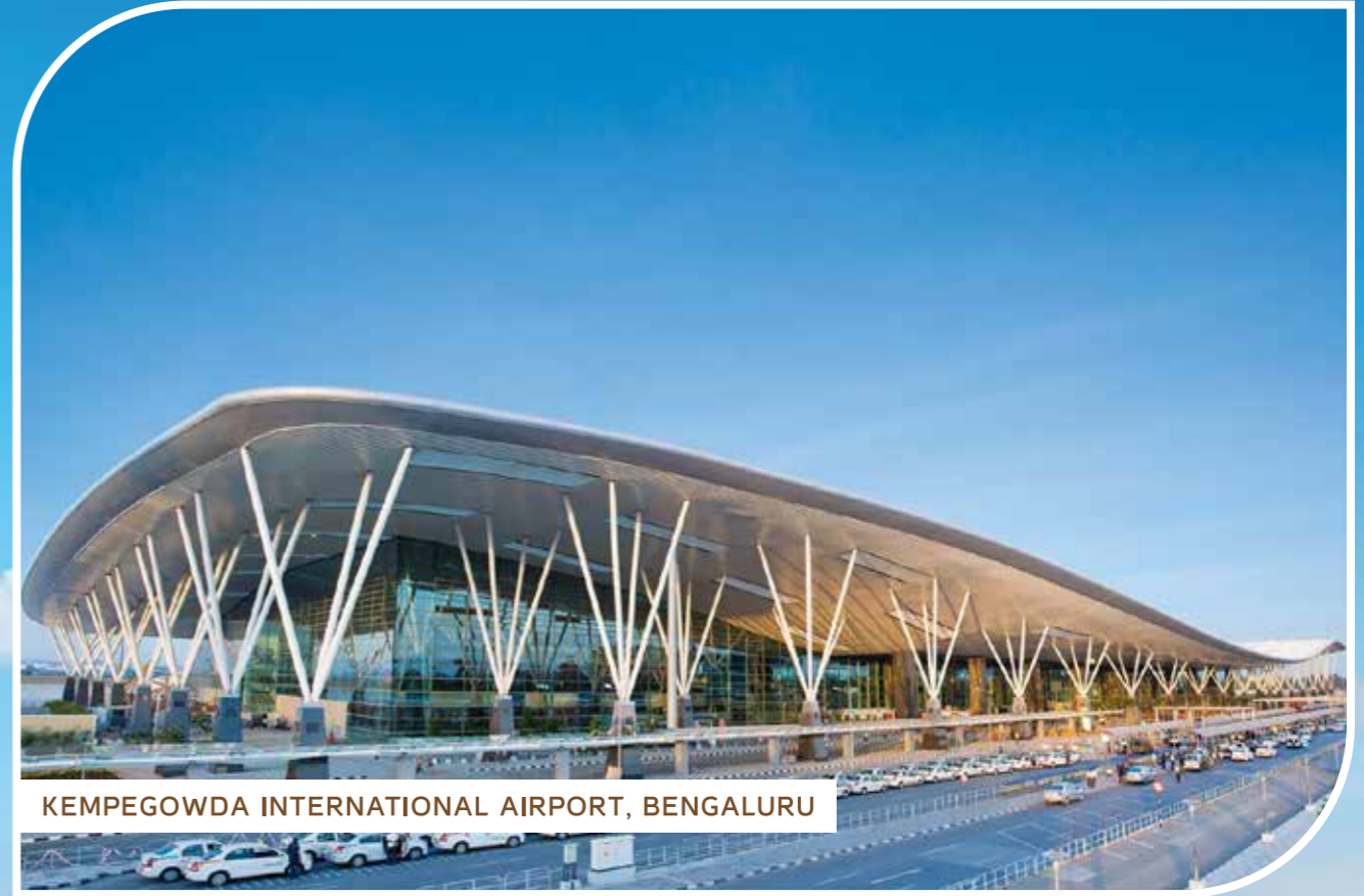
KEMPEGOWDA INTERNATIONAL AIRPORT, BENGALURU