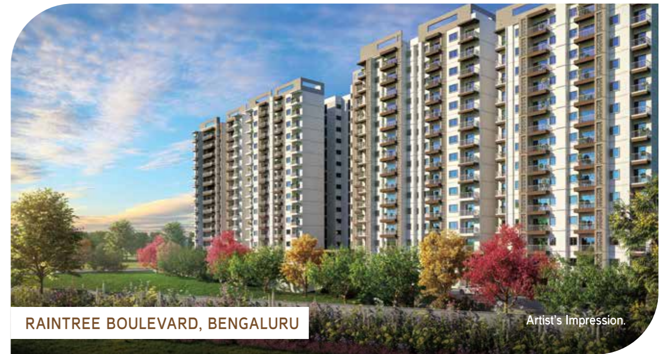
RAINTREE BOULEVARD, BENGALURU