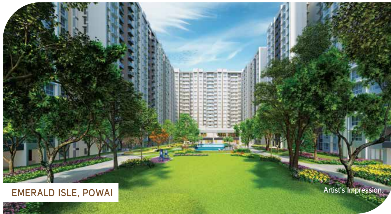
EMERALD ISLE, POWAI