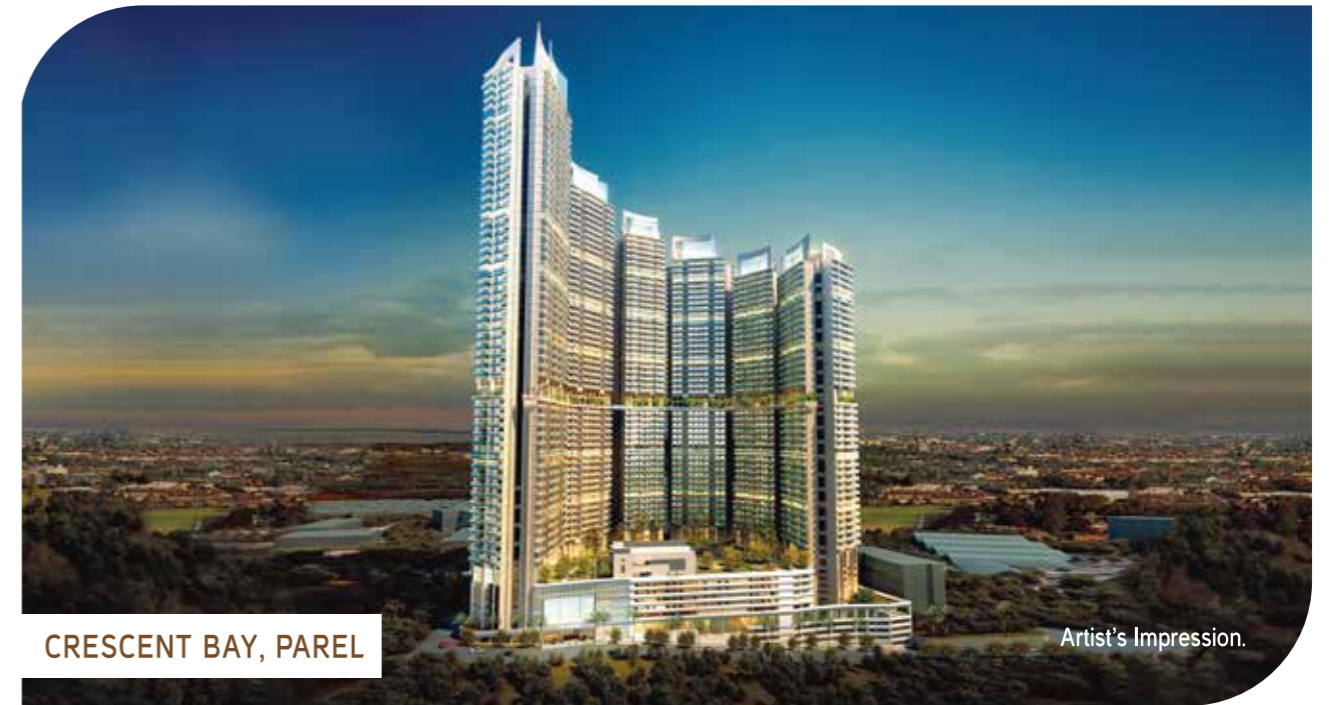
CRESCENT BAY, PAREL