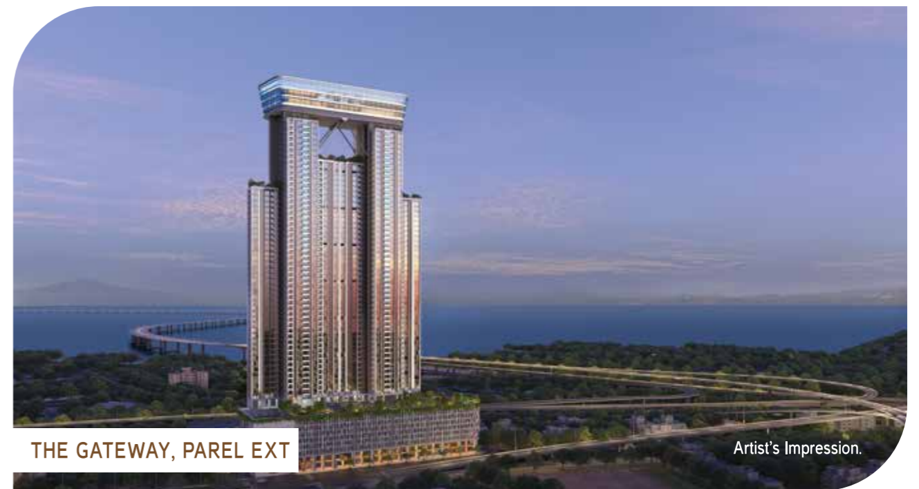
THE GATEWAY, PAREL EXT