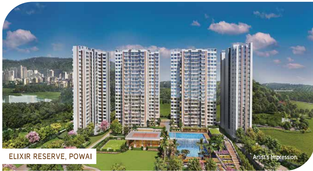
ELIXIR RESERVE, POWAI