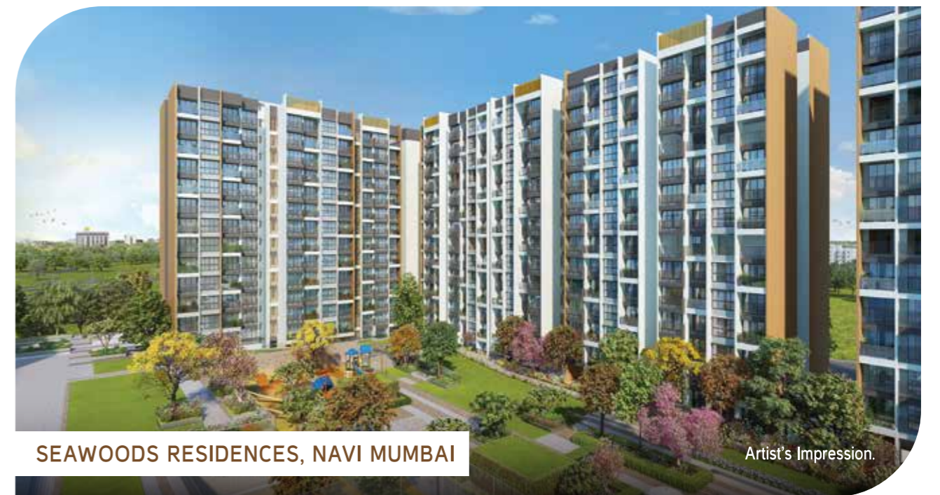
SEAWOODS RESIDENCES, NAVI MUMBAI